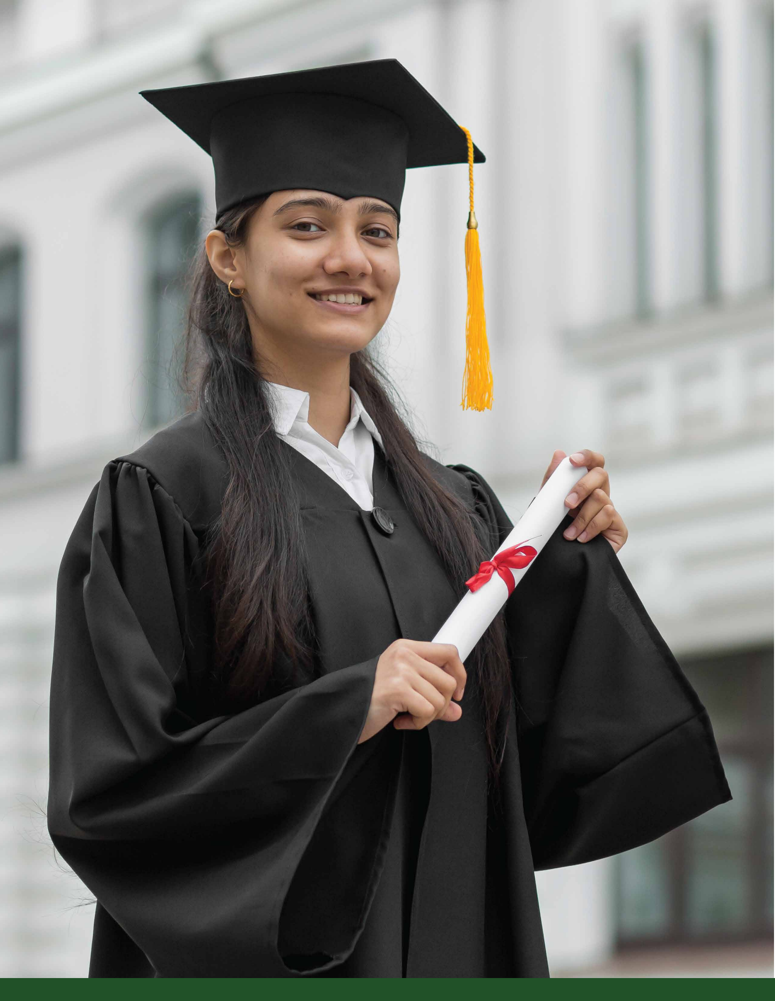
For more information